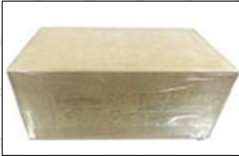
Pic No. 2

Domestic express packaging: Wrapped by Transparent tape black protective film