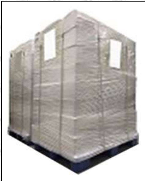
Pic No. 4

International express packaging: Wrapped with yellow tape after wrapping