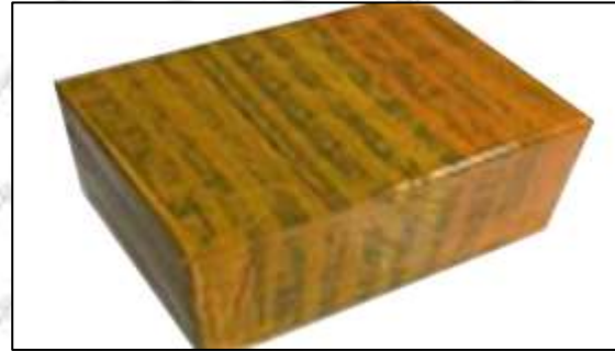
Pic No. 3

Domestic express packaging: Wrapped by Transparent tape black protective film